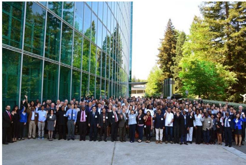
WMO HydroConference 2018: 215 experts from 85 countries

You will also enjoy the fun of team work with nice and skilled people of various nationalities and backgrounds.