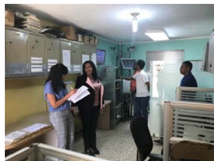
Needs assessment in RA IV