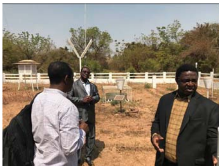
Field visit in RA I with WMO experts

WMO is open also to experts from outside National Hydrological Services , who work on fields and topics relevant to operational hydrology, including measurement and observation technology, innovation, research, forecasting, modelling, service delivery, water management, disaster risk management, dam and reservoir operation, water quality monitoring and modeling, etc.